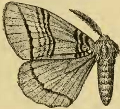
Stibolepis novemlineata ♂ ♀

Very pale ochreous yellow or yellowish white; branches of antennae and abdomen ochreous brown; forewing above at base with four erect slightly-waved black transverse lines, and in apical half with five such lines, of which the first touches the hind angle of